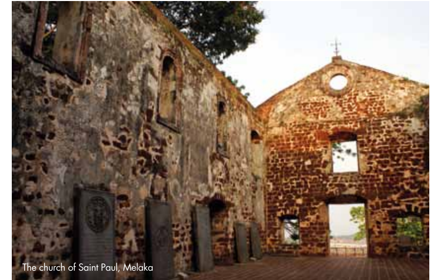
The church of Saint Paul, Melaka

It's the world's only spa that features treatments rooted on the Peranakan or Baba-Nyonya traditional remedies. After you soothe your tired muscles (and experience healing heritage first-hand), choose to retire in one of the Majestic's two signature suites occupying the top floor. Aside from being the most spacious, it offers you a lovely view of the Melaka River and the traditional Malay Village, Kampung Morten.