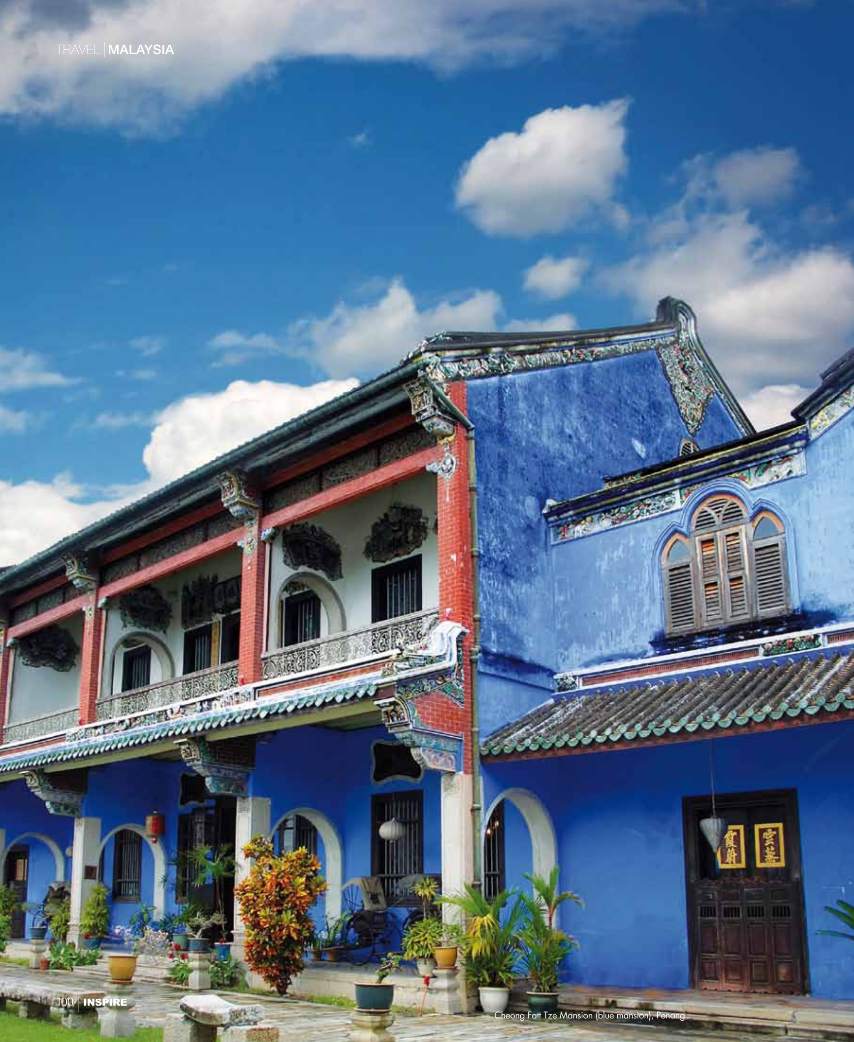
Cheong Fatt Tze Mansion (blue mansion), Penang