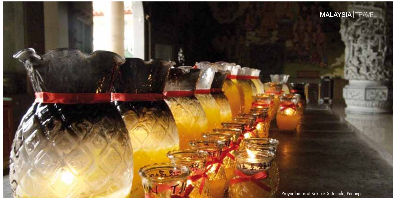
Prayer lamps at Kek Lok Si Temple, Penang

from chic modern design at Hotel Maya to colonial charm at the secluded Carcosa Seri Negara. However, to discover more of Malaysia's rich heritage, venture out of the capital and into its other culturally-steep cities where you can be whisked off into a lavish and exclusive journey.