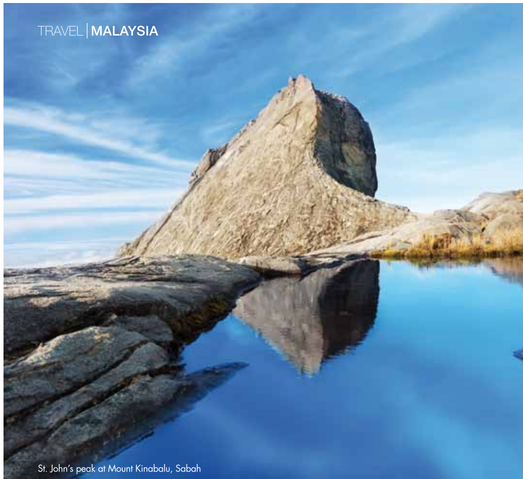
St. John's peak at Mount Kinabalu, Sabah