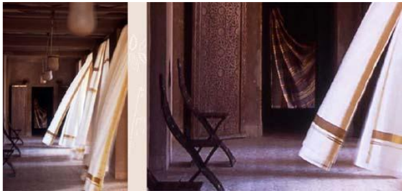
Dinner at Dar Ahlam.

Early morning wake-up to catch the magnificent sunrise over the Sahara. Drive back to Dar Ahlam. Once back at Dar Ahlam, enquire arrange to visit the Valley of the Roses. With a dramatic landscape, you'd have the opportunity to hike in this area. Lunch can be taken en route or in the gardens of Dar Ahlam.